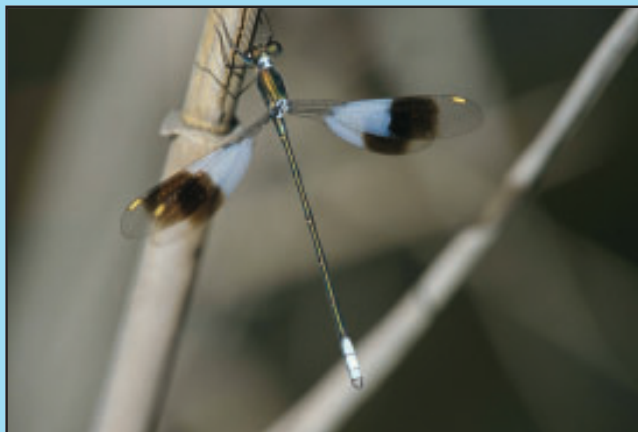
Basking malachite damselfly Chlorolestes apricans was on the verge of extinction, but raising its profile is now leading to conservation action.