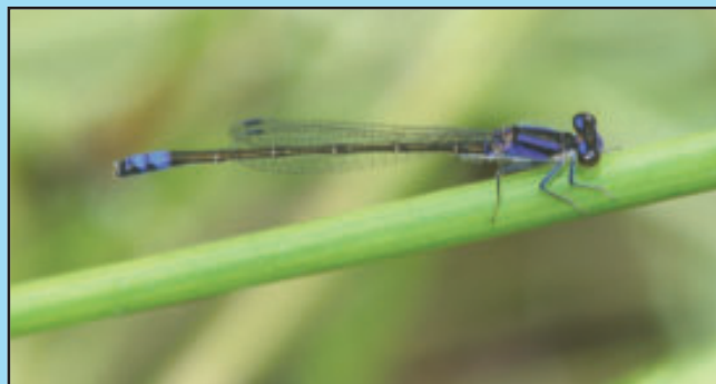
The Ceres Stream damsel Metacnemis angusta, formerly only known from two females, and not seen since 1920, was feared extinct. It has made a dramatic comeback as a result of removal of invasive alien trees under the Working for Water Programme.