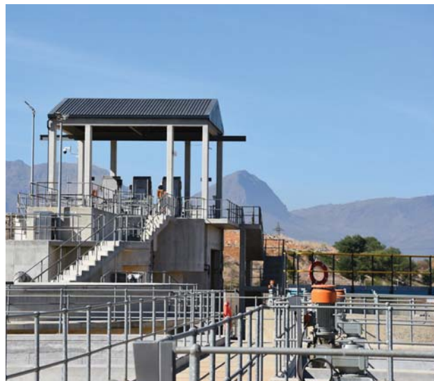
The Wellington wastewater treatment works.

Advantages of the UV process include a high disinfection efficiency against a wide range of microorganisms including chlorine resistant ones. It is considered environmentally safe,