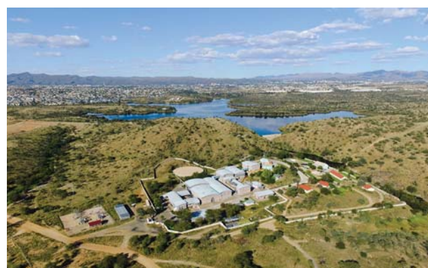
An aerial view of the Windhoek water reclamation plant and Goreangab dam. The Namibian facility, the first such plant in the world, was established in 1968.