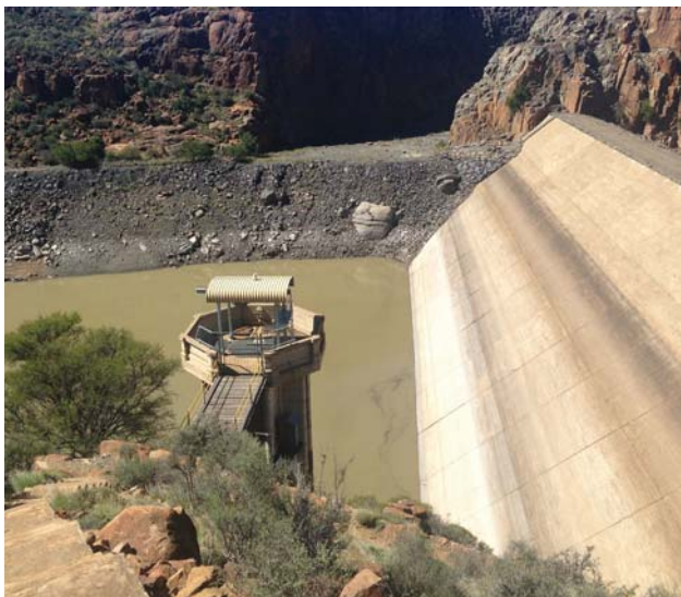
Reusing water treated with advanced technology can free up limited freshwater supplies in dams and rivers for direct human use.

These dissolved organic constituents include low concentrations of a wide range of organic chemicals from industrial and domestic sources (micro-pollutants). Examples include pharmaceuticals and personal care products pesticides, preservatives, surfactants, flame retardants, disinfection by-products and chemicals released by humans such as dietary compounds and steroidal hormones.