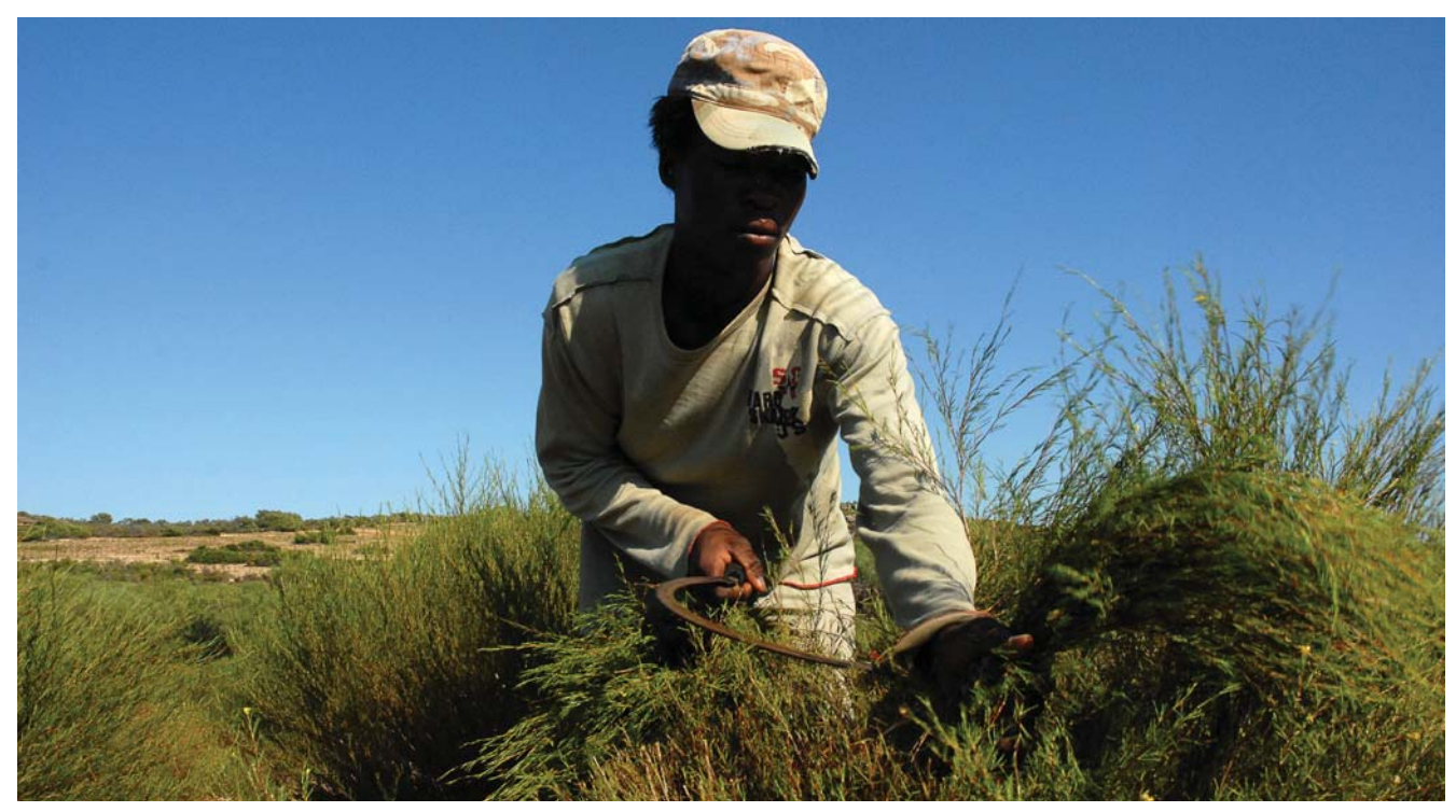
The rooibos crop is harvested in summer, typically hand-cut using a sickle.

Some of the more physically demanding fieldwork entailed digging pits more than a metre deep to collect samples down the soil profile for laboratory analysis, and to install soil moisture sensors at 20 cm depth intervals in the root zone of rooibos plants. The sensors monitored the volumetric soil water content at hourly intervals throughout the study period, while a rain gauge installed in the same field allowed rainfall to be quantified.