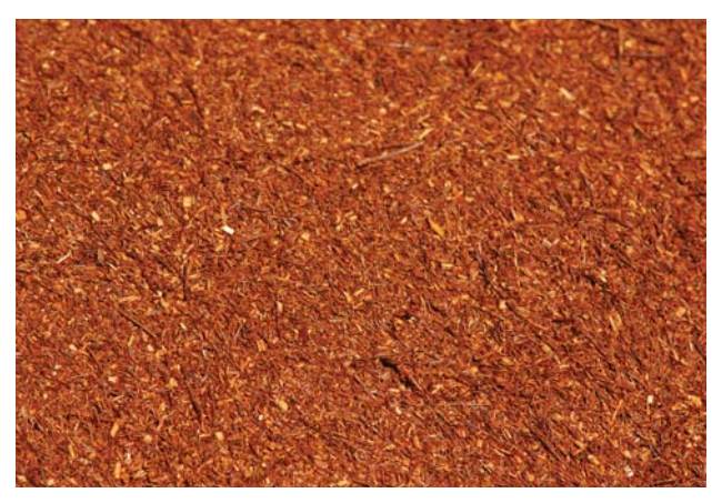
Rooibos leaves following the processing stage with their distinctive red colour.

Importantly, the team's data showed that more than a third of the annual total evapotranspiration was consumed between September and November – the first three months of the growing season – but this was mostly evaporation of soil moisture after winter rains and transpiration by weeds, rather than water use by the rooibos crop itself. Weed and grass growth has become more of a problem in rooibos fields, especially newly planted ones, with the increasing adoption of conservation (no-till) farming methods, which minimise soil disturbance.