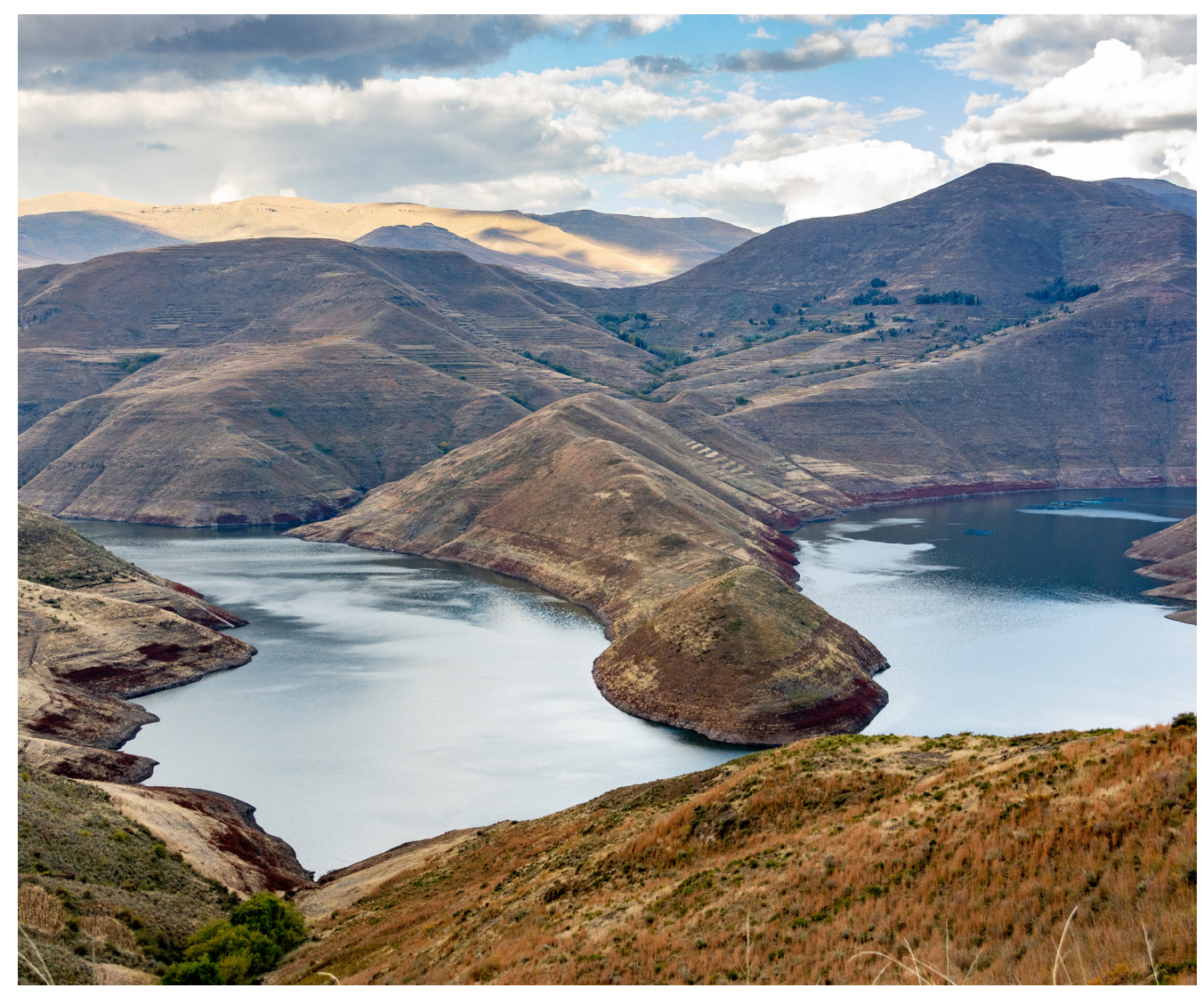
The Katse Dam. While the Lesotho Highlands Water Project has brought much needed water resources to South Africa and income for Lesotho it has not been without its environmental impacts.