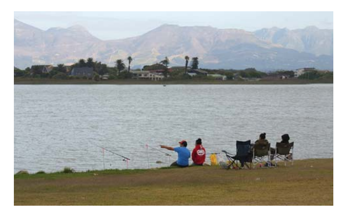
Zeekoevlei is a popular recreational area and forms part of the False Bay Nature Reserve, which must be taken into consideration if used for stormwater harvesting.

In the case of the Cape Flats Aquifer, the potential of using treated wastewater effluent for MAR was thoroughly investigated in a long-running WRC-funded project during the