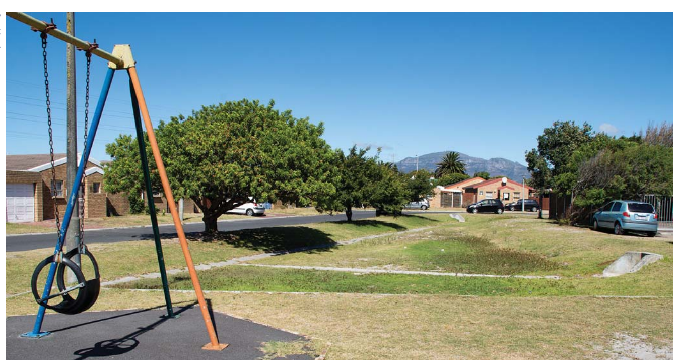
Most of the stormwater ponds in Cape Town are detention ponds that hold water for short periods during rainstorms but are dry for most of the year. Many are used as play-arks or informal sport grounds.

composed of a vegetated surface layer, a middle soil layer with organic matter or fly ash mixed with a filter media, and a deeper storage layer consisting of crushed stone or gravel, with a drain at the bottom.