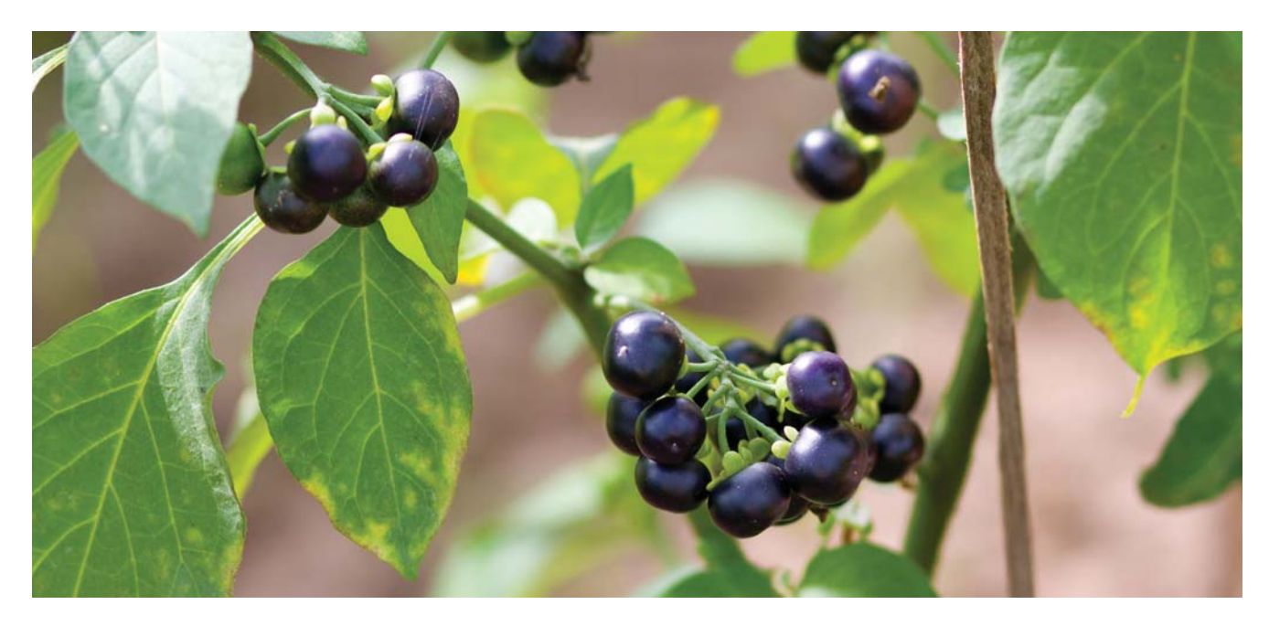
Black nightshade (Solanum retroflexum) is an annual herb-like plant that originated in South Africa. It is also known as sunberry, nastergal, Umsobo, muxe, umsobo wesinja, umosobosobo and lintsontso.

how many South Africans go to bed with empty stomachs. According to Statistics South Africa, food insecurity in the country is increasing, and almost 23.6% of South Africans in 2020 were affected by moderate to severe food insecurity, while almost 14.9% experienced severe food insecurity.