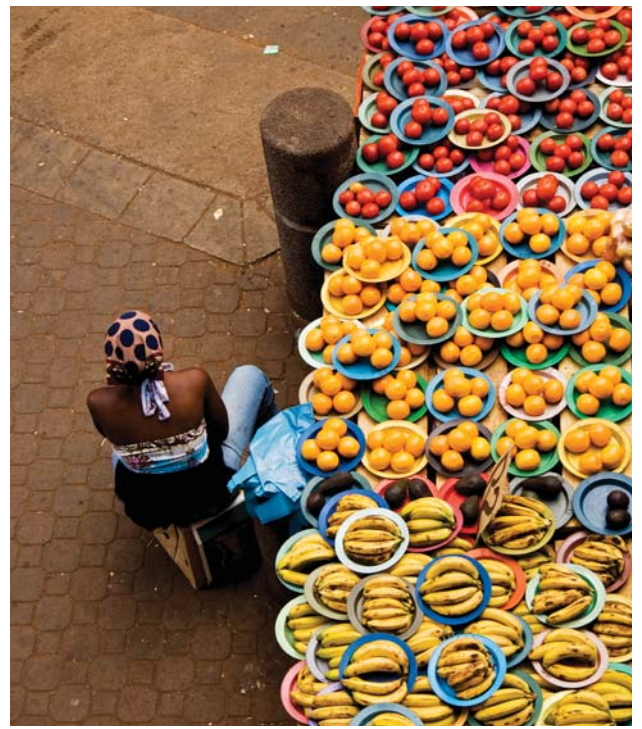
Exotic crops have become staples of our meals, but we are missing out on the multiple advantages of indigenous crops.

graduates to help with translation, tabulation, interviews and questionnaires.