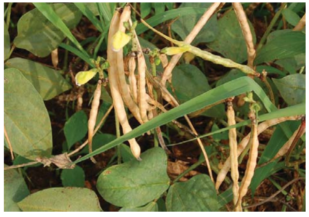
Cowpea pods ready for harvesting.

For more information, refer to WRC Report No. 2715/1/22 , Water use in food value chains of indigenous crops with special focus on production and post-harvest handling of food products.