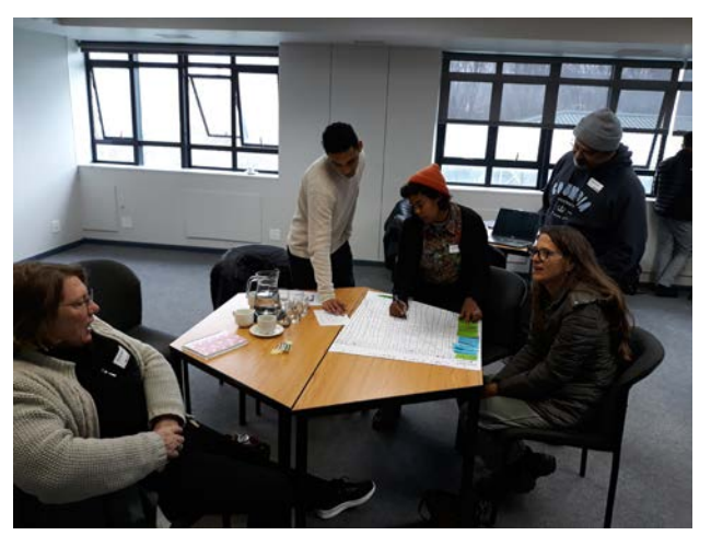
The group at the second Cape Town learning lab deliberate on the strength of ties between actors using or managing groundwater in the Cape Flats aquifer on a scale of 0 to 3, from no interaction to frequent interaction, defined as more regularly than once a month.

The authors explored different scenarios in the two cities, including decreases to rainfall and increases to evapotranspiration and land-cover. It let them and the labs study the effects of shifts in policy and interventions, such as