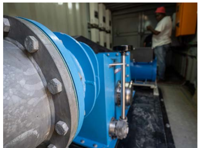
KwaMadiba is a run-of-river, modular unit which turns the potential energy of water flowing into clean electricity.

So far, work on developing the atlas indicates there are existing and new opportunities for hydropower in the country. There are, for instance, opportunities at existing dams and weirs as