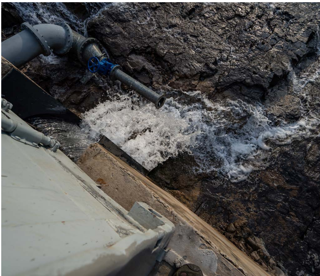
The release from the turbine room is equal to the flow at the intake structure, namely 150 ℓ/s and thus not a consumptive use.

well as on the bulk supply and distribution pipe system. This infrastructure may be retrofitted with turbines to generate electricity to meet the base or peak electricity demands, Van Dijk points out. The advantage of retrofitted hydropower is that no new infrastructure is required for energy generation, he says.