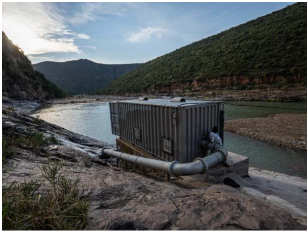
The plant is located inside a retrofitted shipping container and provides enough electricity for approximately 50 rural households.