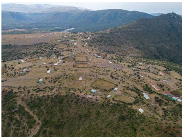
The electricity generated by the plant is used by the remote village of Kwa-Madiba in the Oliver Tambo District Municipality.

The turbine room houses the turbine, generator, controls and regulators of the plant. The type of turbine selected offered a smaller power station footprint, hence less civil works. The plant is designed to allow for a complete unstaffed operation. “The system is efficient, dependable and cost-effective,” Van Dijk says.