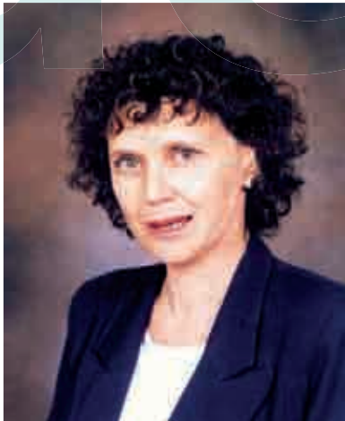
Dr Rivka Kfir Chief Executive Officer Water Research Commission

During the year under review the WRC effectively functioned according to its mandate as reflected by its mission which, as in previous years, provided the framework for its strategic and operational initiatives, and in accordance with the organisation's core strategy and business plan as approved by the Minister of Water Affairs and Forestry. The WRC has fulfilled the role of a 'hub' for water-centred knowledge, reporting to and supporting its shareholder, the Government of South Africa through the Minister of Water Affairs and Forestry, the Department of Water Affairs and Forestry (DWAF), other Government Departments (national, provincial and local), and all other related players within the water sector and related sectors. Throughout the year, the WRC has been strongly attuned to the needs of the end-users who benefit from the water-centred knowledge that emanates from their support. The WRC continued to function as a networking organisation, linking the nation and working through partnerships. The WRC employed innovative strategies to develop novel (and practical) ways of packaging and transferring knowledge which includes, for example, policy briefs and other technology-based products aimed at serving decision makers, the water sector and the community at large.