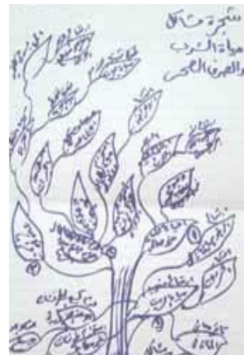
Problem tree for Manyal Hani in Egypt