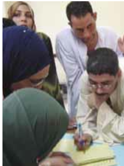
Visioning and scenario building meeting