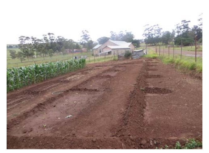
In-field rainwater harvesting (IRWH) basins have proven potential to increase maize yields, particularly when used in conjunction with supplemental irrigation and fertilizer application.

Google Earth reveals rows of fallow fields that were intensively cultivated in the past. During the apartheid era, when the area formed part of the Ciskei homelands, villagers were given government assistance in the form of extension services, access to tractors and other farming implements, and the ability to sell their produce through the Ciskei Marketing Board.