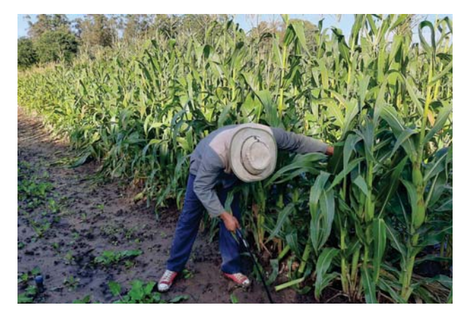
The project team conducted cropland experiments at Fort Cox College in nearby Middledrift, and provided training to the second-year students studying crop sciences and agri-business for three years, reaching some 300 students. The experimental plot was also visited by project beneficiaries and stakeholders during annual 'information days'.

Biodigesters were installed at 14 households that already had water storage tanks and access to cattle nearby, since the biodigesters needed to be 'fed' with water and cow dung at least every five days. Two control digesters with full-gas profiling and meteorological measurement capability were installed at SolarWatt Park on the Alice Campus of the University of Fort Hare.