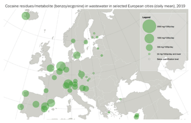
The 2019 SCORE monitoring campaign confirmed that cocaine remains the most widely and heavily abused illicit drug in Europe.

inhabitants), taking into account the population served by each WWTW, were also calculated to estimate drug use patterns in the different communities.