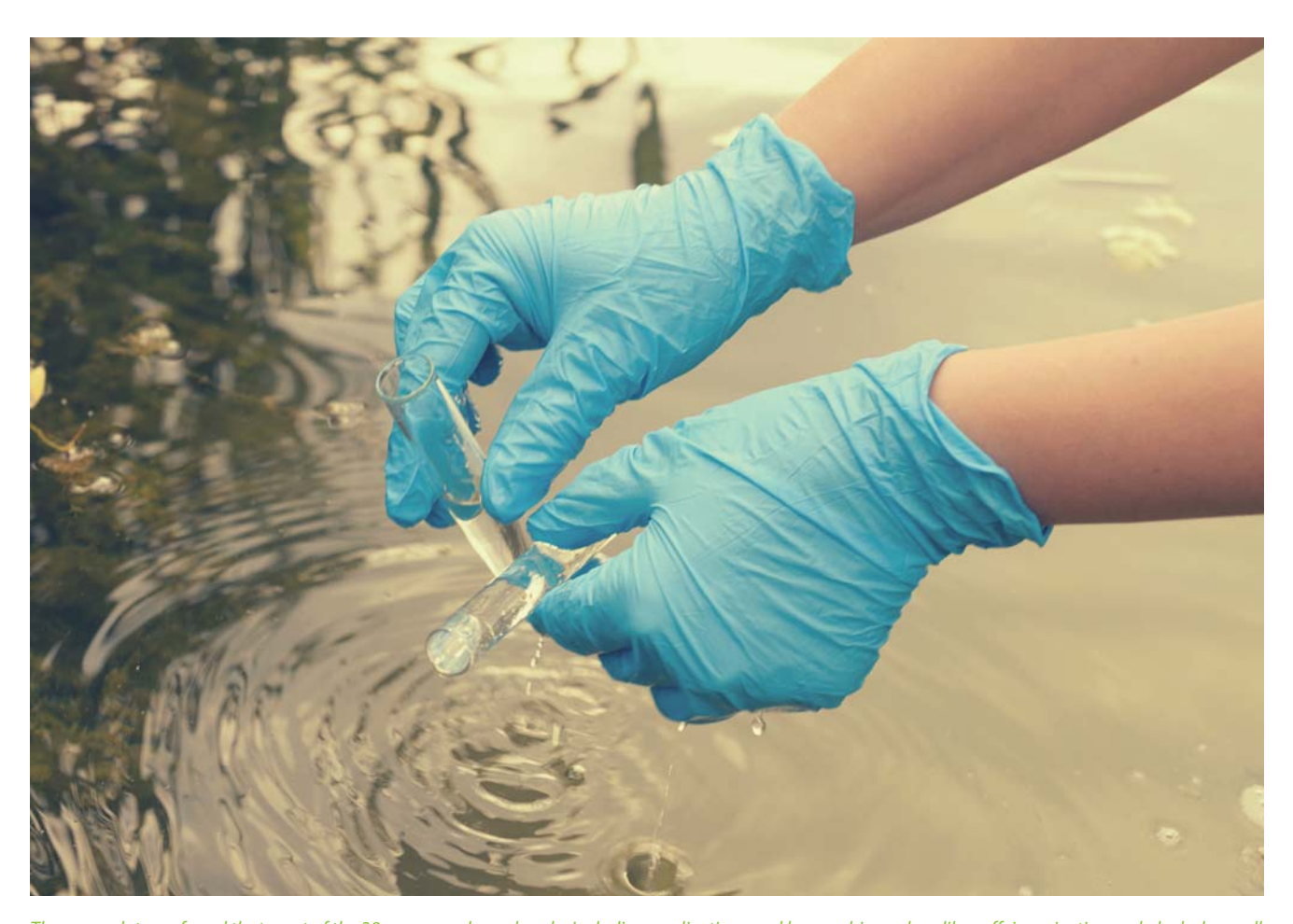
The research team found that most of the 38 compounds analysed – including medications and human biomarkers like caffeine, nicotine and alcohol as well as illicit drugs – were removed with high efficiency at both treatment plants.

Rather than considering only the concentration of compounds in the samples, the mass loads (grams per day) were calculated for each to compensate for the variation in daily influent and effluent flow rates, and this was then used to determine the removal of the compounds during wastewater treatment. Population-normalised drug loads (mg per day per 1 000