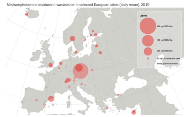
The use of methamphetamine – known in South Africa as 'tik' – was historically restricted to Czechia and Slovakia, but has been steadily increasing in other countries in recent years.

Surprisingly, though, at the Gauteng WWTW the average concentration of S-(+)-methamphetamine at the river sampling station 3.5 km downstream of the final effluent discharge point was 18 times higher than in the upstream river water. Since the enantiomer is removed by the WWTW with relatively high efficiency, it is clearly entering the river from an additional source downstream of the WWTW.